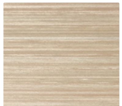
CWP - HPL

Wood is a natural material, the colours shown in the samples should only be used as a guide.